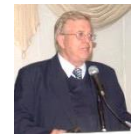
Kalmyk Village in Howell NJ (EBTV)