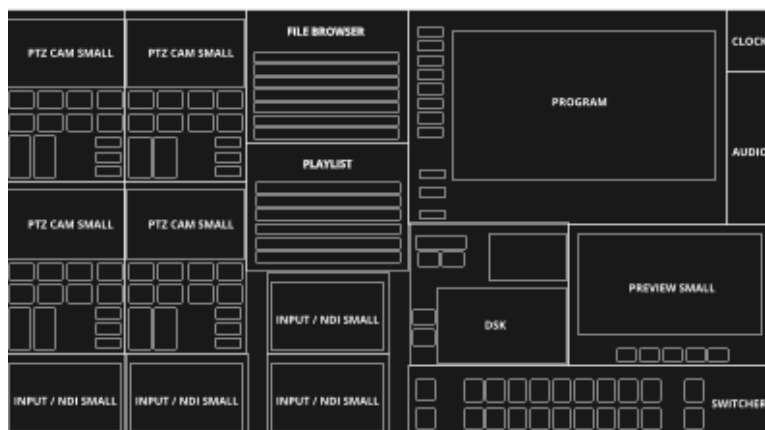
Single Monitor Layouts

We've created Layout Templates that let you select the most appropriate for your production venues. There are four Single Monitor Templates , and six Dual Monitor Templates . These let you take advantage of larger camera control and monitoring panels, and an expanded Preview monitor window. You can customize and save as many Layouts as you wish to accommodate multiple production venues.