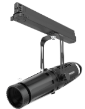
Mini LEDko Spot

Also, in the past, I had been asked about providing entertainment-type fixtures to record outdoor events. More often than not, these took place regularly, and in a single location..... such as a park, in something like a band shell or gazebo. Outdoor venues were always a challenge. There were usually limited power sources requiring lots of cabling, creating trip hazards. Lighting stands on uneven ground are always risky, especially tethered to power cables. Add to this the crowds of people, especially children, and there are plenty of things to worry about on top of the quality of your production!