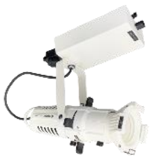
Mini LEDko Profile

Our Coemar line debuted some great solutions in November at the Lighting Dimensions show in Las Vegas. Our new line of Mini-LEDkos provide great output at very low wattages, and are available in many configurations, including track-mount. A variety of control options are available, such as on/off, on-board dimmer pot, DALI, Bluetooth, DMX and (soon) wireless DMX. Inexpensive Smart Track can be easily and, unobtrusively, installed anywhere. Fixtures can then be mounted anywhere along these tracks and provided with power and control. These fixtures can be left there,