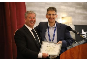
Honored to receive Certificate of Award for supporting JAG's new Internet TV channel