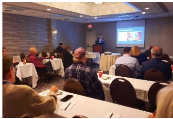
Kicking off the JAG Conference with the TelVue Users Group and Breakfast

exhibit booths inside the large group ballroom, afforded better opportunities to mingle with customers and showcase products during breaks, yet also remain an important presence during the larger panel presentations. It created a very inclusive environment for vendors and customers alike, a welcome return and grateful exit from the social distancing and virtual trade show era.