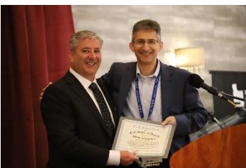
Honored to receive Certificate of Award for supporting JAG's new Internet TV channel