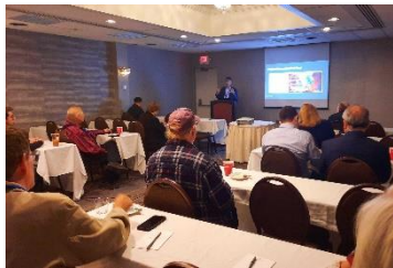
Kicking off the JAG Conference with the TelVue Users Group and Breakfast

exhibit booths inside the large group ballroom, afforded better opportunities to mingle with customers and showcase products during breaks, yet also remain an important presence during the larger panel presentations. It created a very inclusive environment for vendors and customers alike, a welcome return and grateful exit from the social distancing and virtual trade show era.